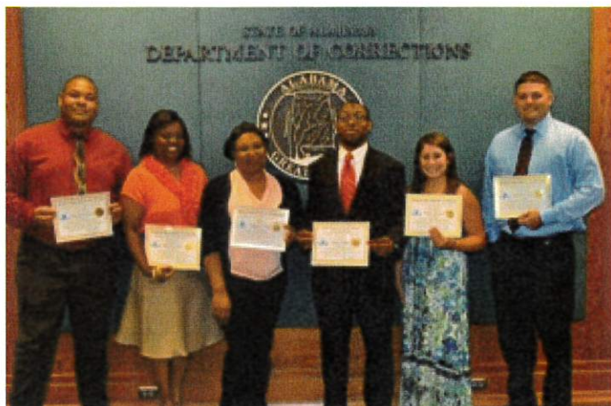
The ACESF hosts a reception each year to honor deserving students selected for scholarship awards.