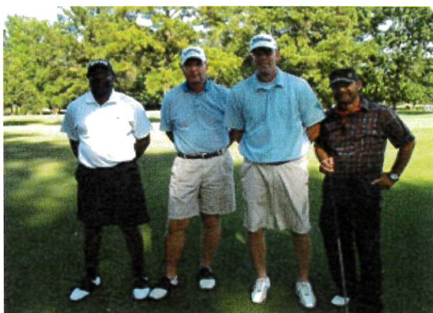
The ACESF hosts two charity golf tournaments each year and welcomes all to participate.